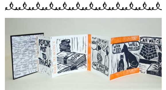
Reasons Not To Travel- Part 2

Class canceled due to lack of enrollment gets full refund-