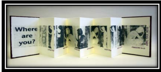
Where Are You?